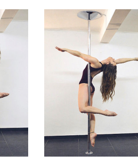
Hood ornament variations