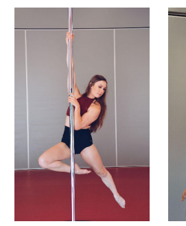
Forearm climb hang