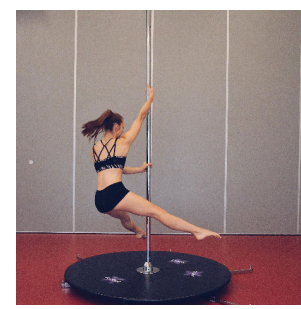
Step around - 2