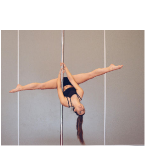
Helicopter / Straddle