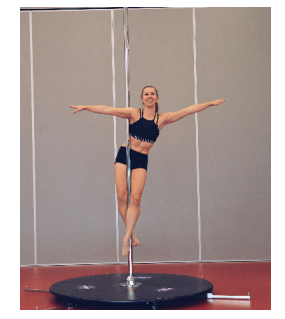
Jesus / Crucifix