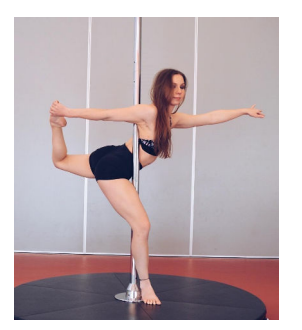
Ballerina / Swan