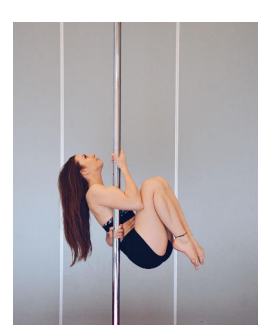
Back support hold