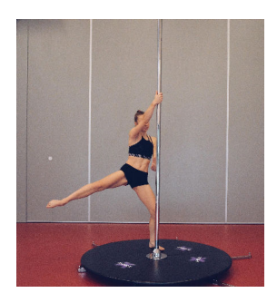
Step around - 3