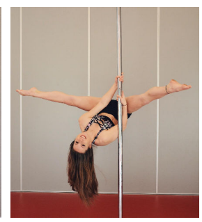
Funny grip invert