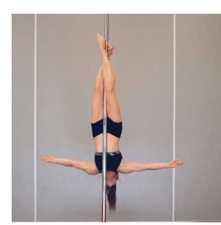
Jesus / Crucifix