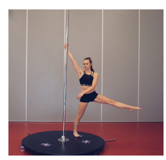
Step around - 1